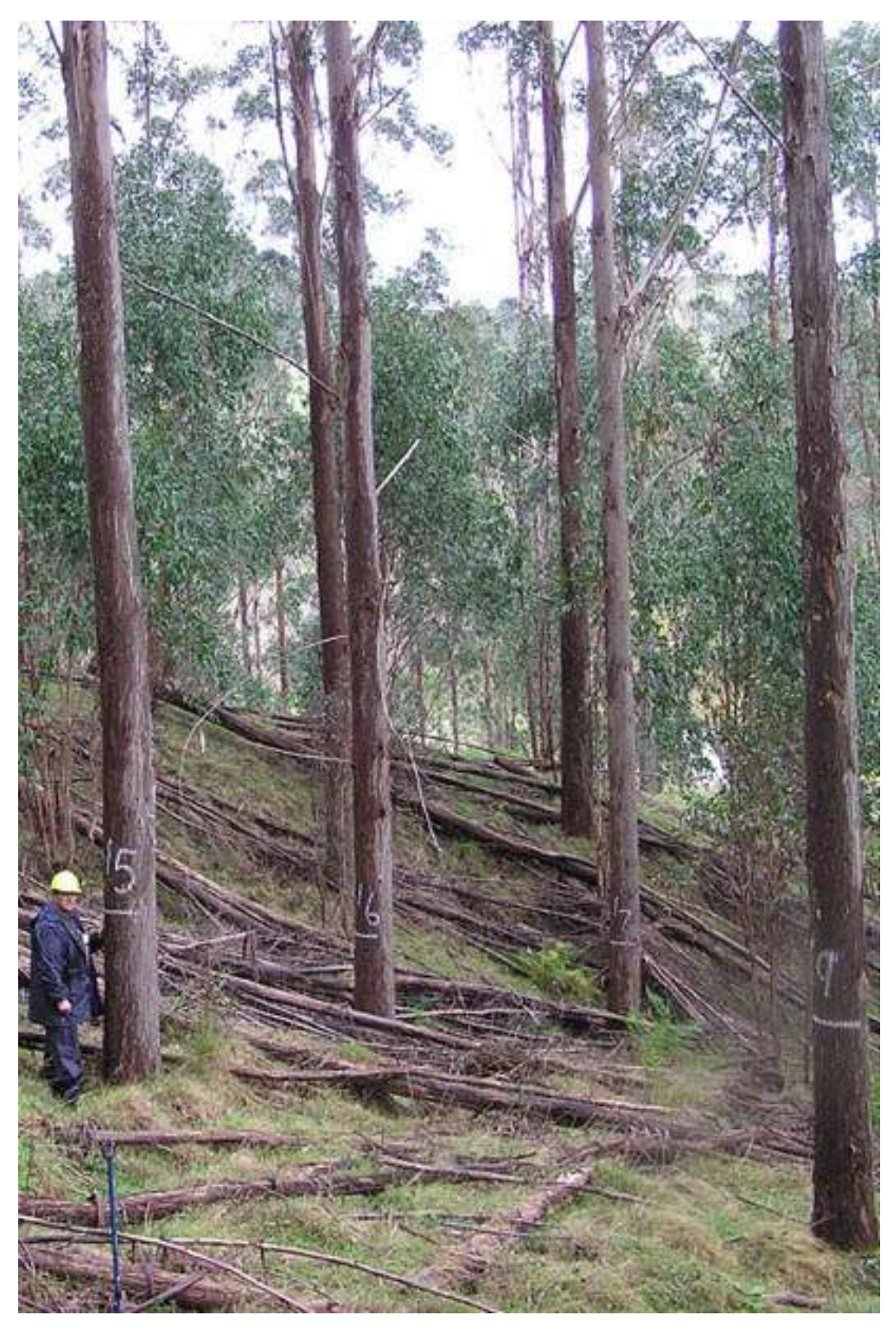
Excellent pruned and thinned E. fastigata stand, Poverty Bay