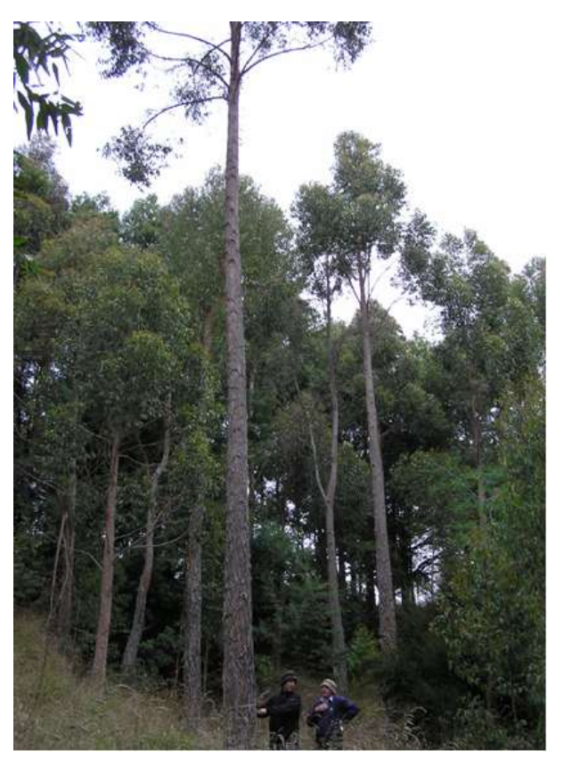
Well pruned E. globoidea tree, Canterbury

A New Zealand study has shown that decay within the stem progresses upwards and downwards as well as inwards towards the pith. No outward movement towards the wood laid down after pruning was detected. Rotcausing organisms entering through the pruning wound are likely to stay within the defect core and it is important to ensure that this core is kept as small as possible.