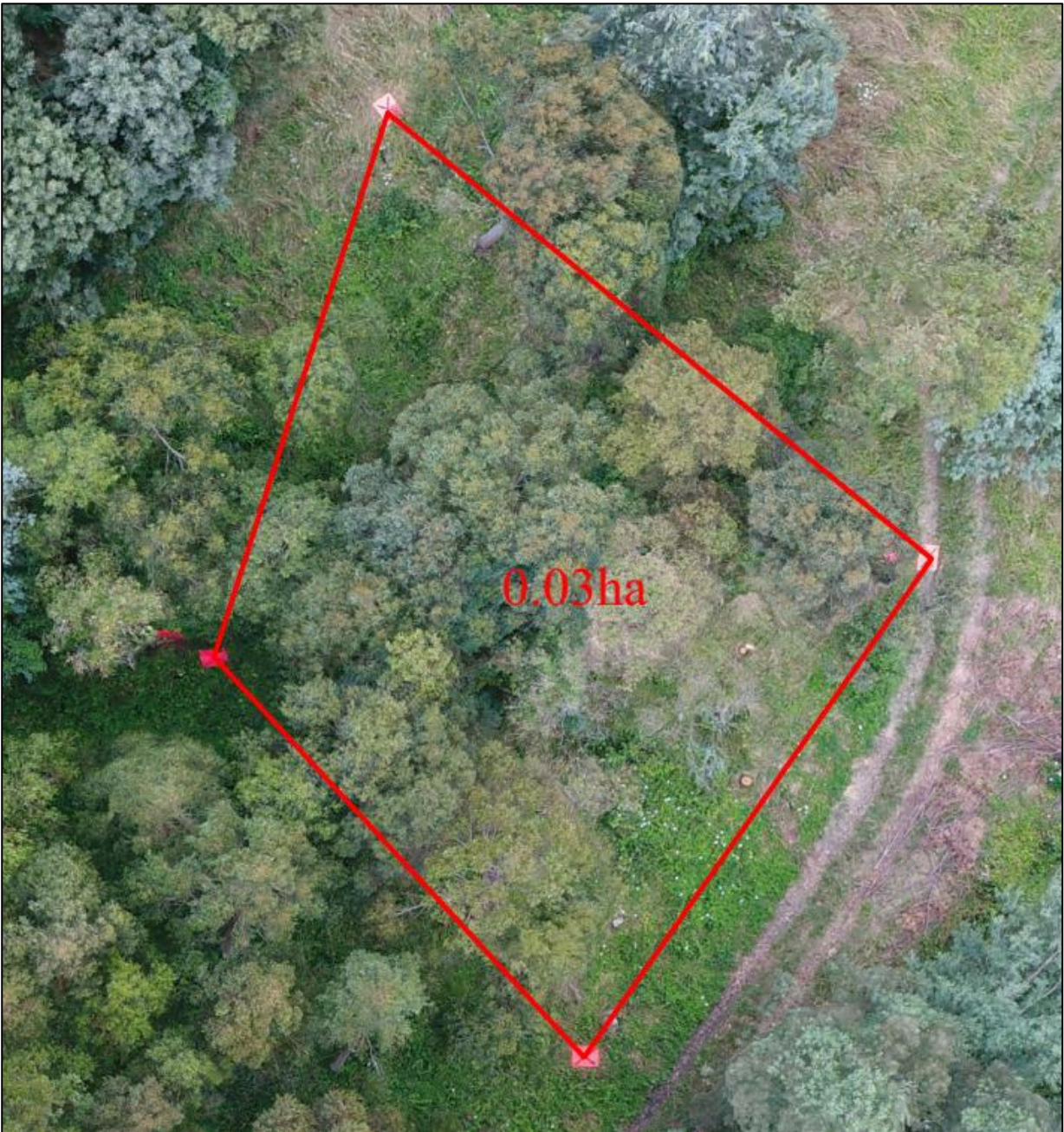
Giffords Rd Orthophoto