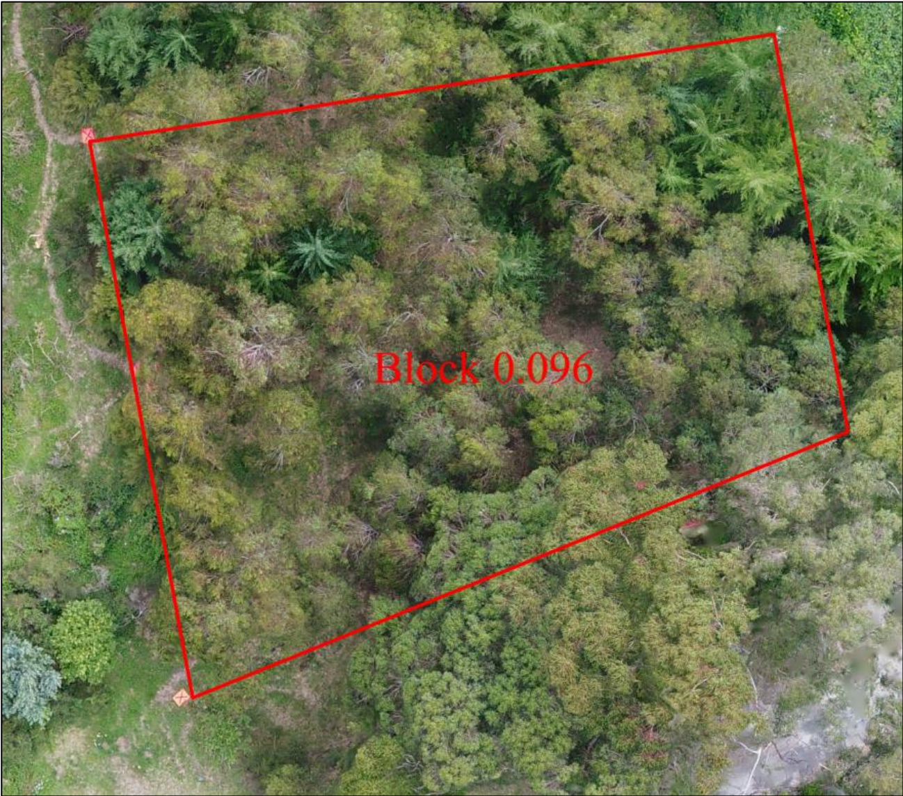
Pukaka Valley Orthophoto