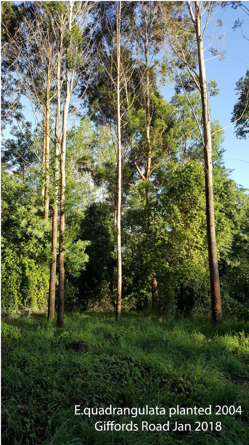
E. quadrangulata planted 2004 Giffords Road Jan 2018