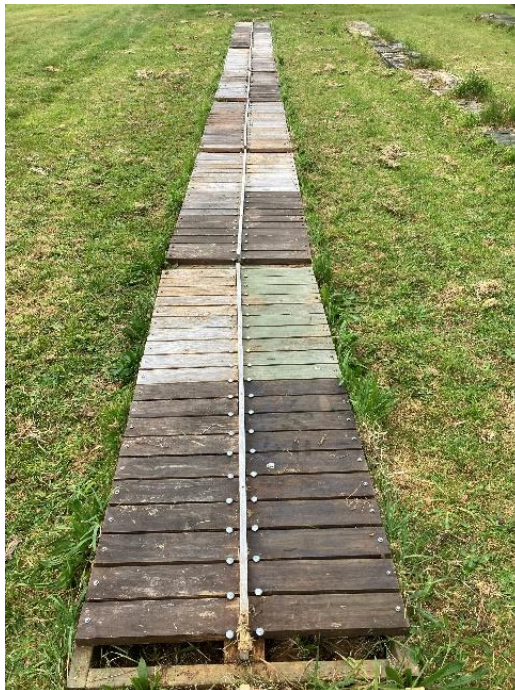
Figure 2: General view of decking trial after one years exposure (September 2022).