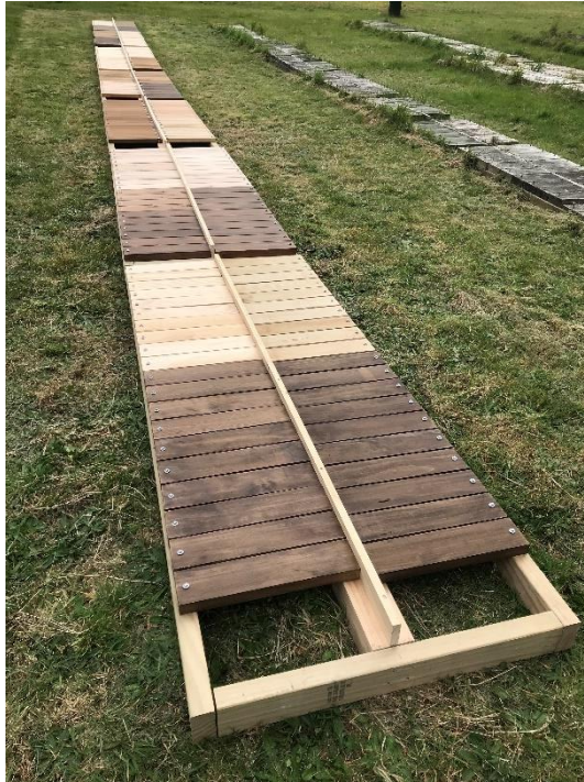
Figure 1: General view of decking trial at the time of installation (September 2021).